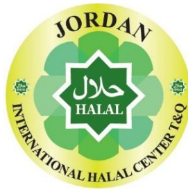
Figure (2): HC Halal Accredited Body logo to issue Halal certificate as per (EIAC – Emirates International Accreditation center) all Logo shall be use as per accredited branch