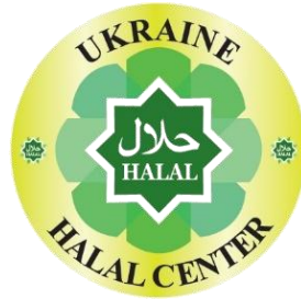
Figure (2): HC Halal Accredited Body logo to issue Halal certificate as per (EIAC – Emirates International Accreditation center) all Logo shall be use as per accredited branch