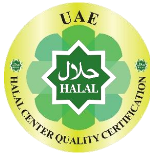
Figure (2): HC Halal Accredited Body logo to issue Halal certificate as per (EIAC – Emirates International Accreditation center) all Logo shall be use as per accredited branch